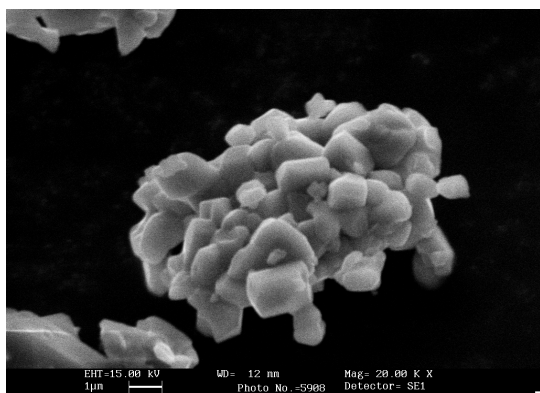
Fig. 3 .A